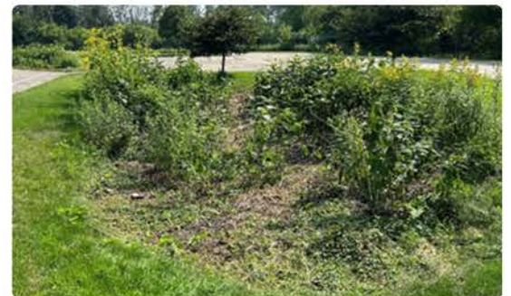
After photo: once woody vegetation and invasives were identified and removed, the basin needed to be replanted with native plant plugs to fill in bare areas.

The information in this fact sheet provides general maintenance recommendations. Refer to your maintenance plan and agreement for specific requirements.