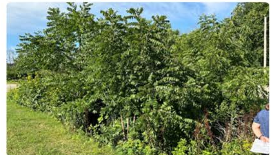
Before photo: vegetation management at a poorly maintained bioretention basin.