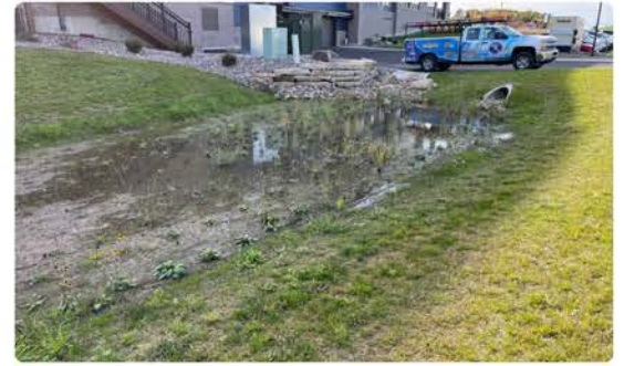
A bioretention basin that has remained wet due to clogging and overwatering, preventing proper vegetation growth.