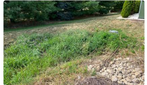
A bioretention basin that has not been properly maintained. Weeds have taken over and covered the outlet structure.