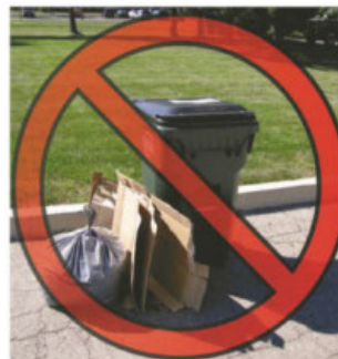
NO Items Leaning Against Cart.