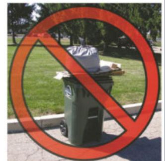
NO Items Placed On Top of Cart.