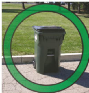
YES! All Items Placed Inside Cart.

5. The Town will not collect auto parts, chemicals, construction materials, dirt, electronics, hazardous waste, hot ashes or coals, paint, motor oil, or rocks. State law prohibits residents from disposing aluminum cans, appliances, CD players, cell phones, computers (along with mice, keyboards, monitors, and other accessories), corrugated cardboard, DVD players, fax machines, glass bottles and jars, lead acid batteries, magazines, motor oil, newspapers, office paper, plastic containers, printers, steel (tin) cans, televisions, tires, VCR's, and yard waste into their regular refuse.